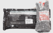
Emergency Trauma Dressing 6" (1x) P-MED-TD-3