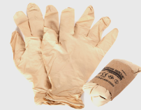
Trauma Gloves (Rolled 1x Pair) PN: P-MED-GLOVE-02