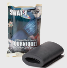
SWAT-T Pressure Device (1x) PN: P-MED-TQ-4-BK