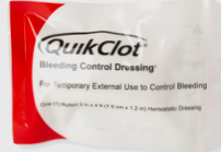
Quikclot Bleeding Control Dressing (1x) PN: P-MED-QUIKCLOT-WH